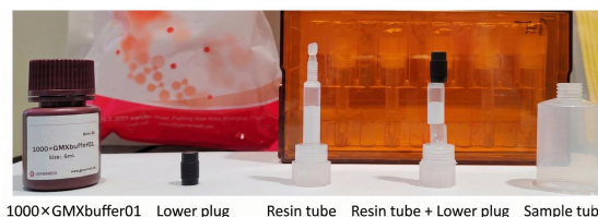
1000xGMXbuffer01 Lower plug Resin tube Resin tube + Lower plug Sample tube

High throughput Dozens of samples purified at once